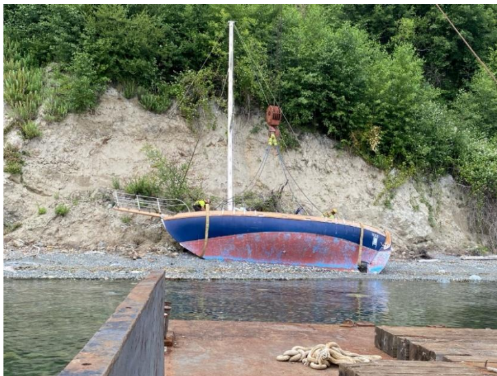
Derelict Vessel Removal at Possession Point.