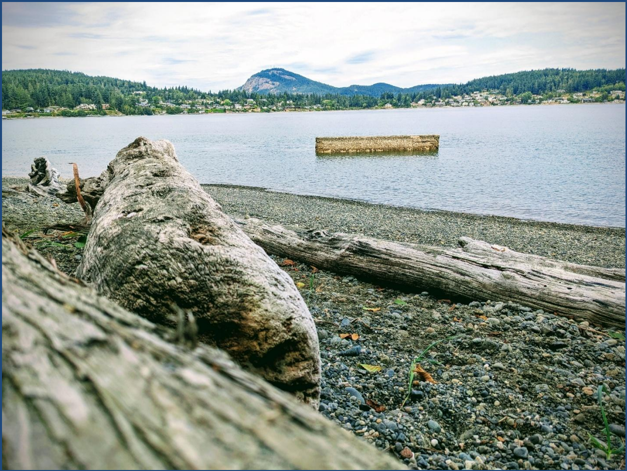
A peaceful moment at Hoypus Point.