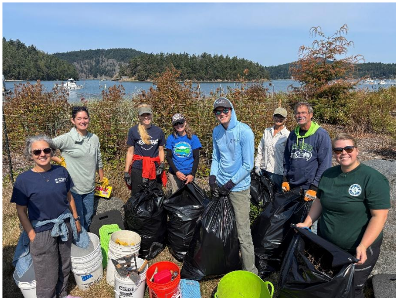
Volunteers holding up bags of their weeded plants.

Thanks to dedicated volunteers, this site continues to become more established and provides much-needed habitat for nearshore life.