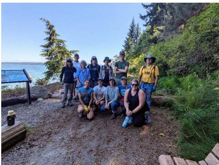
Volunteer stewards mulch the native plants at Hoypus Point.

In 2025, the MRC in partnership with the NW Straits Foundation (the project sponsor) and Washington State Parks, has continued providing ongoing care for the restoration plantings to encourage and promote vegetation establishment. Through the organization of multiple volunteer stewardship events at the project site, the site has thrived over the summer months thanks to regular weeding and watering.