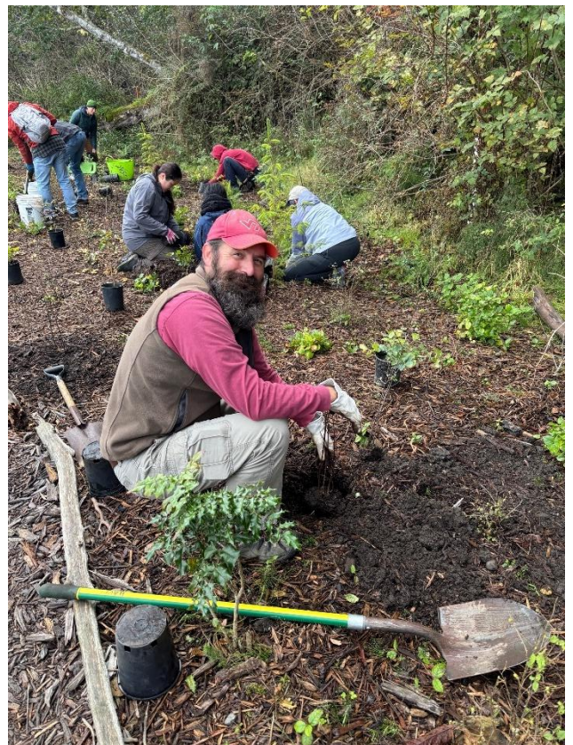
Volunteers plant native vegetation in celebration of Orca Recovery Day 2025.