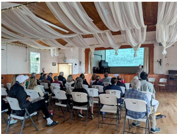
Island County Sea Level Rise workshop.