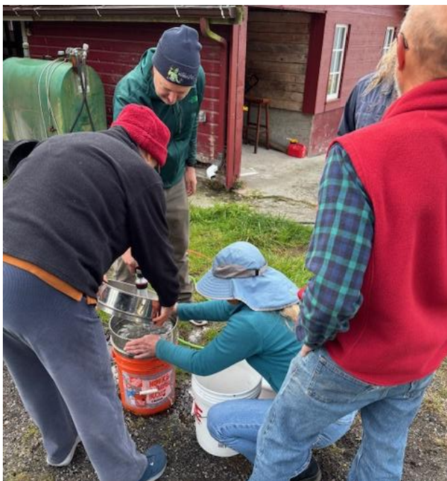
Forage fish team processing samples at Keystone Farm.