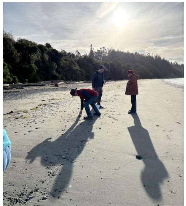
Volunteers collecting sediment on a sunny winter day at Keystone Farm.