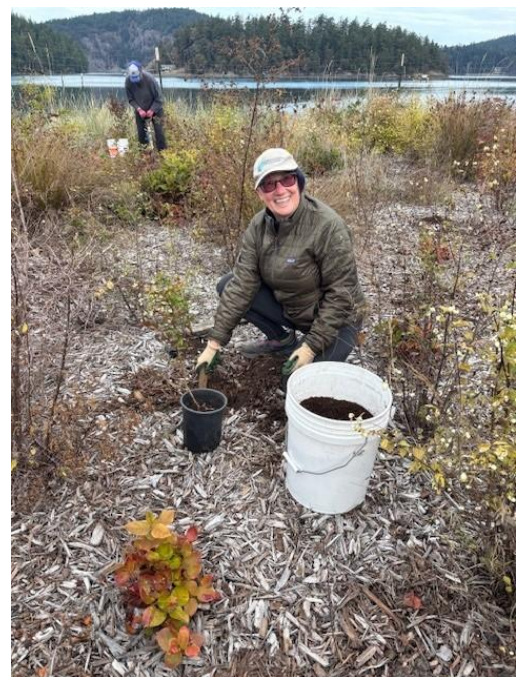
Volunteers plant native vegetation in celebration of Orca Recovery Day 2025.