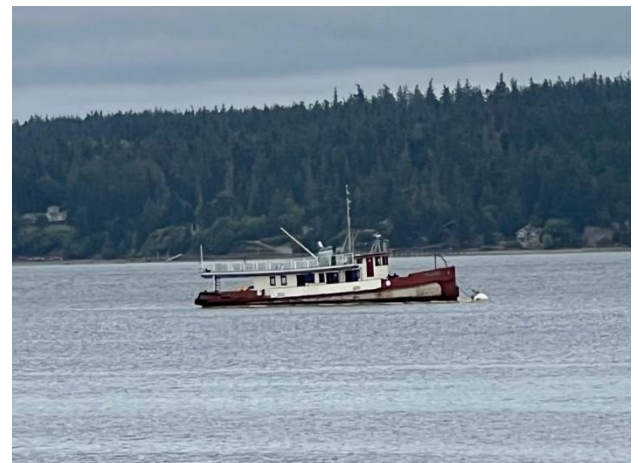
Derelict Vessel.