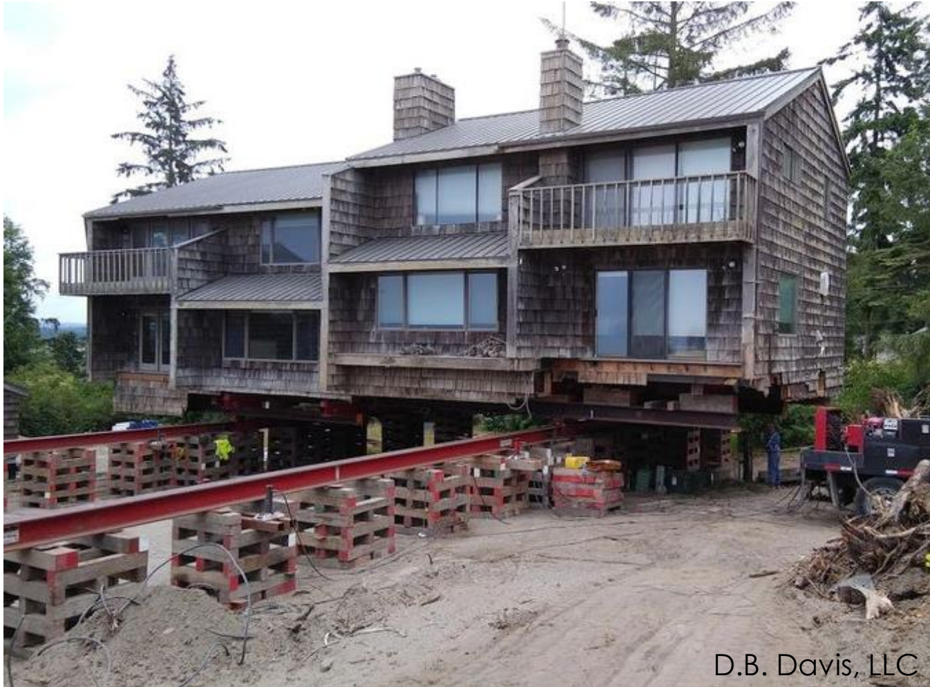
D.B. Davis, LLC