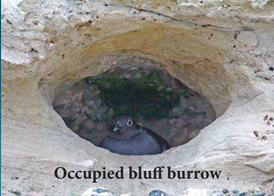
Occupied bluff burrow

Each summer Whidbey Island is home to 1,000 Pigeon Guillemots that gather at more than two-dozen breeding colonies.